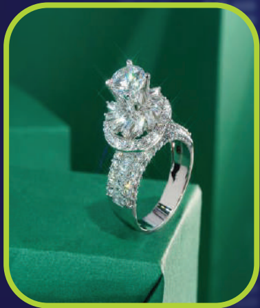
DAILY ROI 1% - 2%