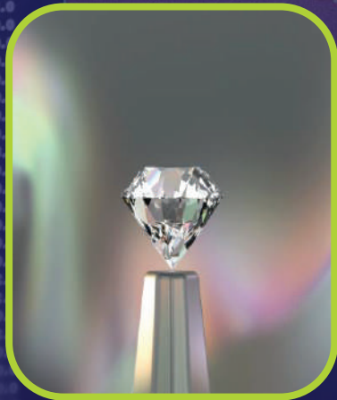
DIRECT REFERRAL BONUS -10%