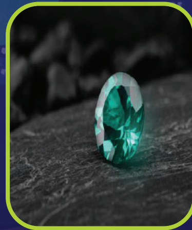
ROYALTY CLUB INCOME