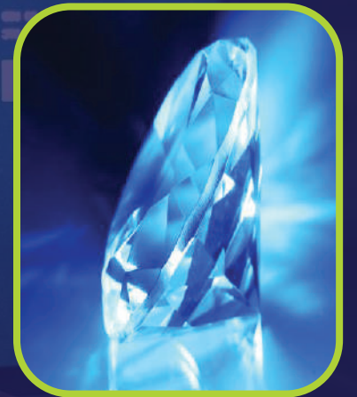
AWARDS AND REWARDS