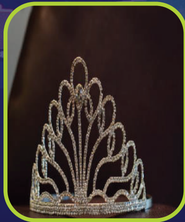
MATCHING BONUS -10%